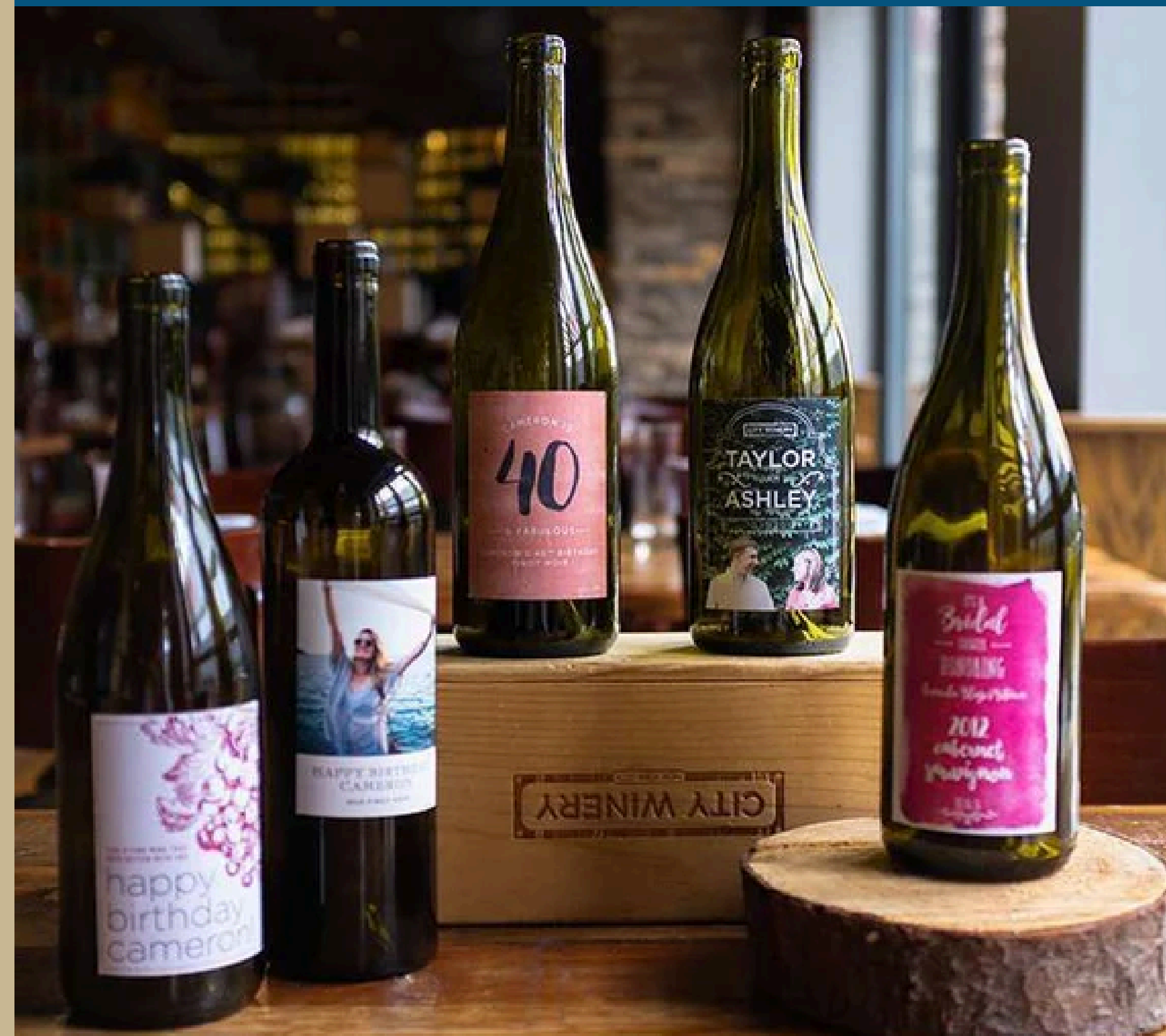
Examples of customized bottles created by City Winery for previous events.