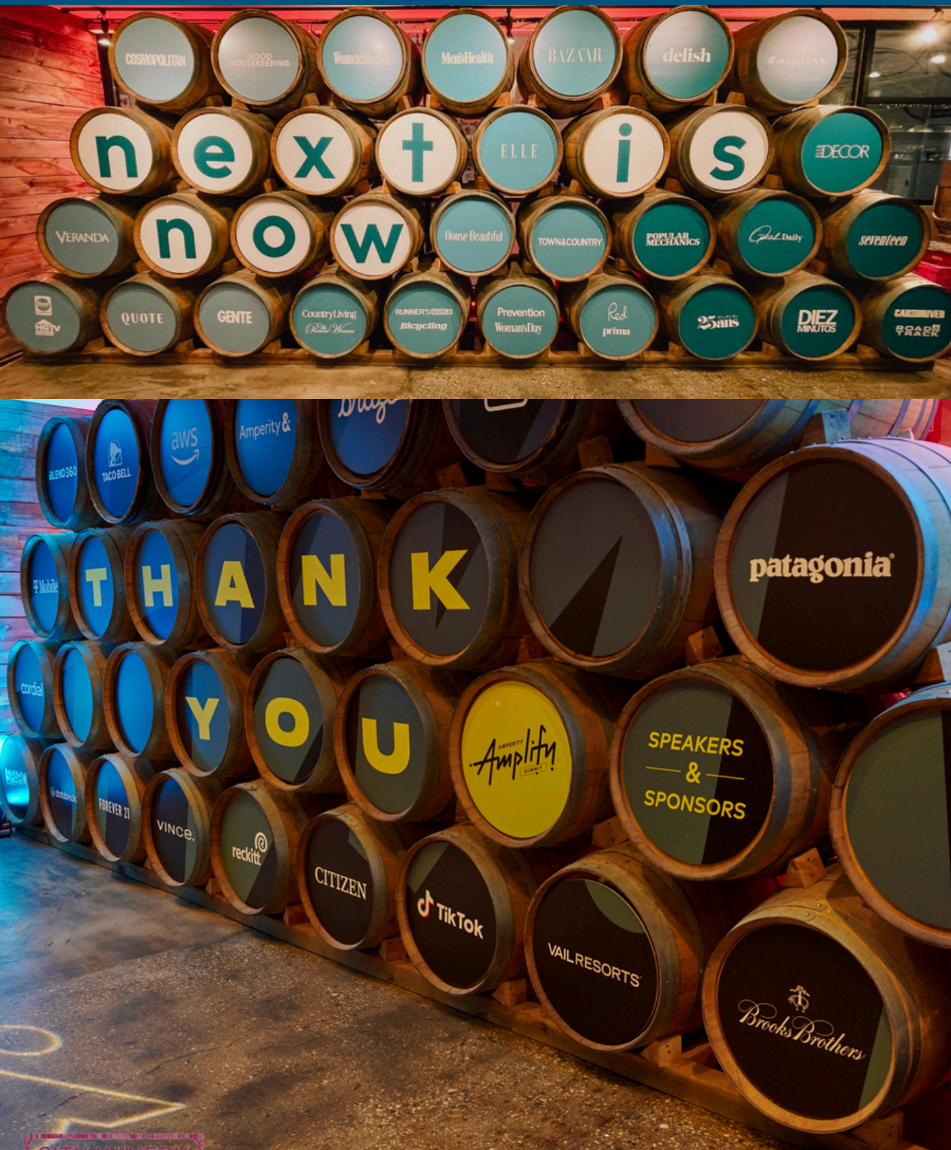
Barrel branding examples at previous City Winery events. As Presenting Sponsor, your branding would be primary focus on these and other barrels.